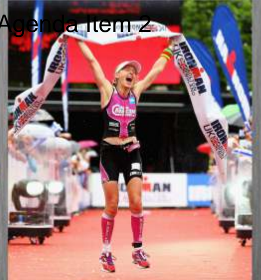
Agenda Item 2