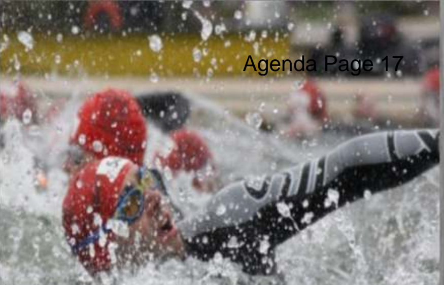
Agenda Page 17